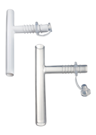
includes 2 Plug/Ring sets

1 Tube, 2 Plug/Ring Sets, 1 IFU, 1 PATIENT-PAK™ per carton