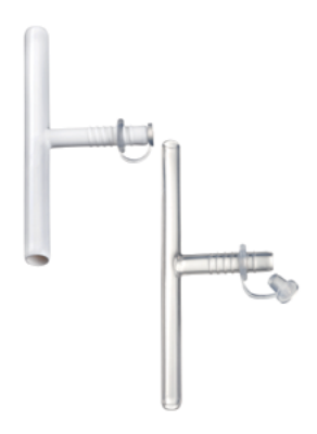
includes 2 Plug/Ring sets

1 Tube, 2 Plug/Ring Sets, 1 IFU, 1 PATIENT-PAK™ per carton