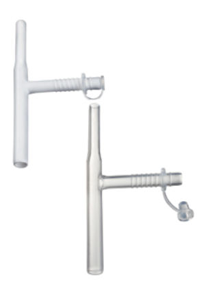
includes 2 Plug/Ring sets

1 Tube, 2 Plug/Ring Sets, 1 IFU, 1 PATIENT-PAK™ per carton