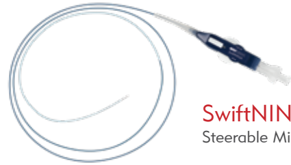
SwiftNINJA® Steerable Microcatheter