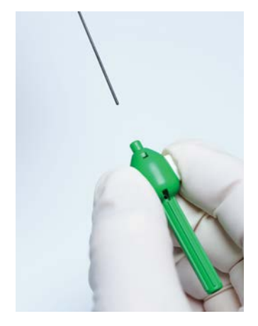
SQUEEZE: Squeeze the white top cap toward the green body to align lumens