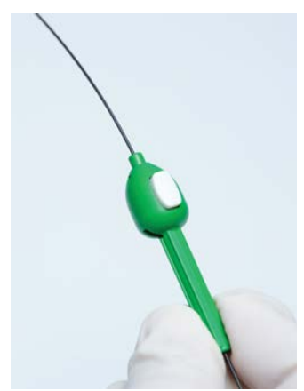
TORQUE: Easy grip ridges enhances steering and torque performance